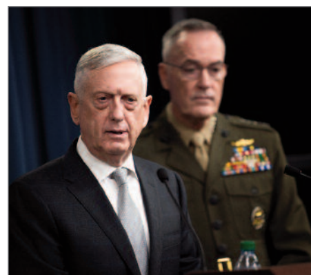
Defense Secretary James N. Mattis and Marine Corps Gen. Joe Dunford, chairman of the Joint Chiefs of Staff, brief reporters on US airstrikes during the operation.