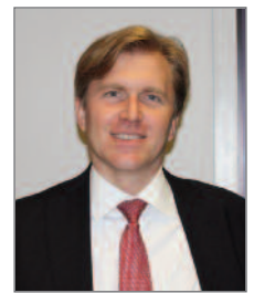
Mr. Elbridge Colby