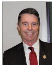
Rep. Rob Wittman (VA-01)