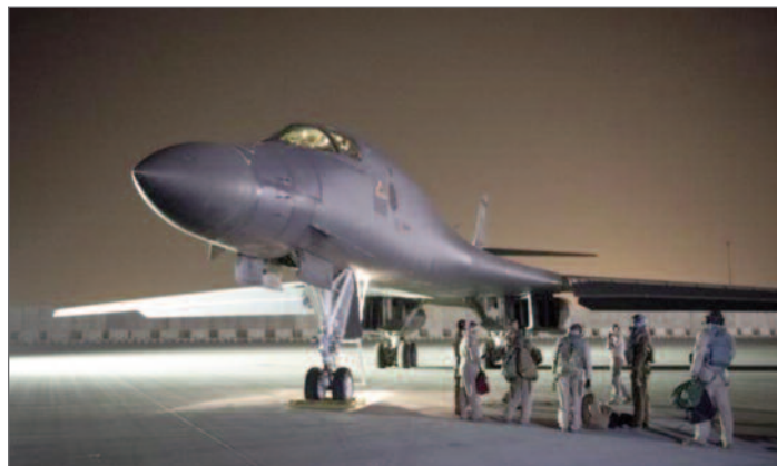
In a multinational strike against chemical weapons targets in Syria, April 14, 2018, two Air Force B-1B Lancer bombers operating from Al Udeid Air Base, Qatar, released 19 Joint Air-to-Surface Standoff Missile weapons during the operation.

The coalition show of force was in response to the Assad regime's continued use of chemical weapons. An April 7 suspected chemical attack on the town of Douma east of Damascus reportedly killed at least 40 and sickened more than 500.