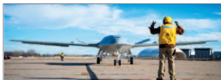
Boeing's MQ-25 unmanned aerial refueler, known as T1, is currently being tested at Boeing's St. Louis site. T1 has completed engine runs and deck handling demonstrations designed to prove the agility and ability of the aircraft to move around within the tight confines of a carrier deck.

According to the U.S. Navy, the MQ-25 Stingray will allow for better use of combat strike fighters by extending the range of deployed Boeing F/A-18 Super Hornet, Boeing EA-18G Growler, and