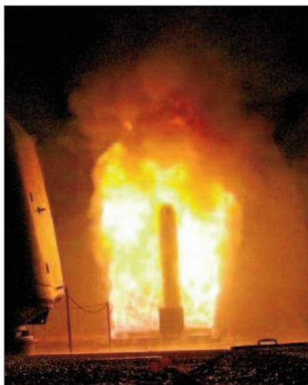
The guided missile cruiser USS Monterey fires a Tomahawk missile in the Red Sea.

President Trump ordered the strikes to stop the regime from using such inhumane weapons again. US Defense Secretary James N. Mattis said stopping the atrocities is in the vital national interests of the United States. "Obviously, the Assad regime did not get the message last year," he said. ■