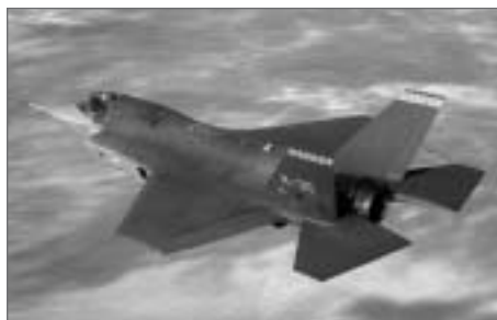
F-35 Joint Strike Fighter