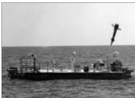
Weapons Testing at Eglin Gulf Range

The test was the first in a program to build an offshore scoring system on the Eglin Gulf Test Range, allowing weapons, like the Small Diameter Bomb and the Joint Air-