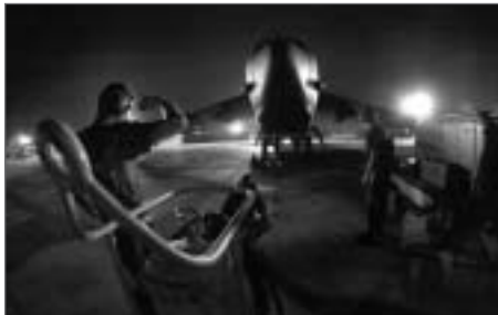
B-52 bomber preparations

Some of the airmen were just glad to get away from the freezing temperature at Minot and enjoy the