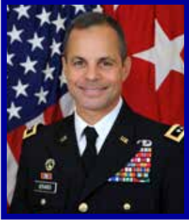
LIEUTENANT GENERAL ANTHONY IERARDI, USA