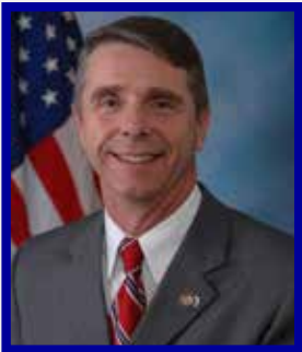
CONGRESSMAN ROB WITTMAN