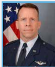
Colonel (Select) “PJ” Maykish, USAF