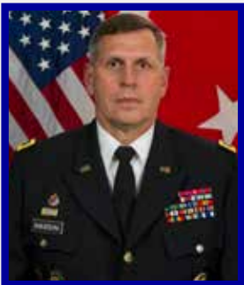
MAJOR GENERAL OLE KNUDSON, USA